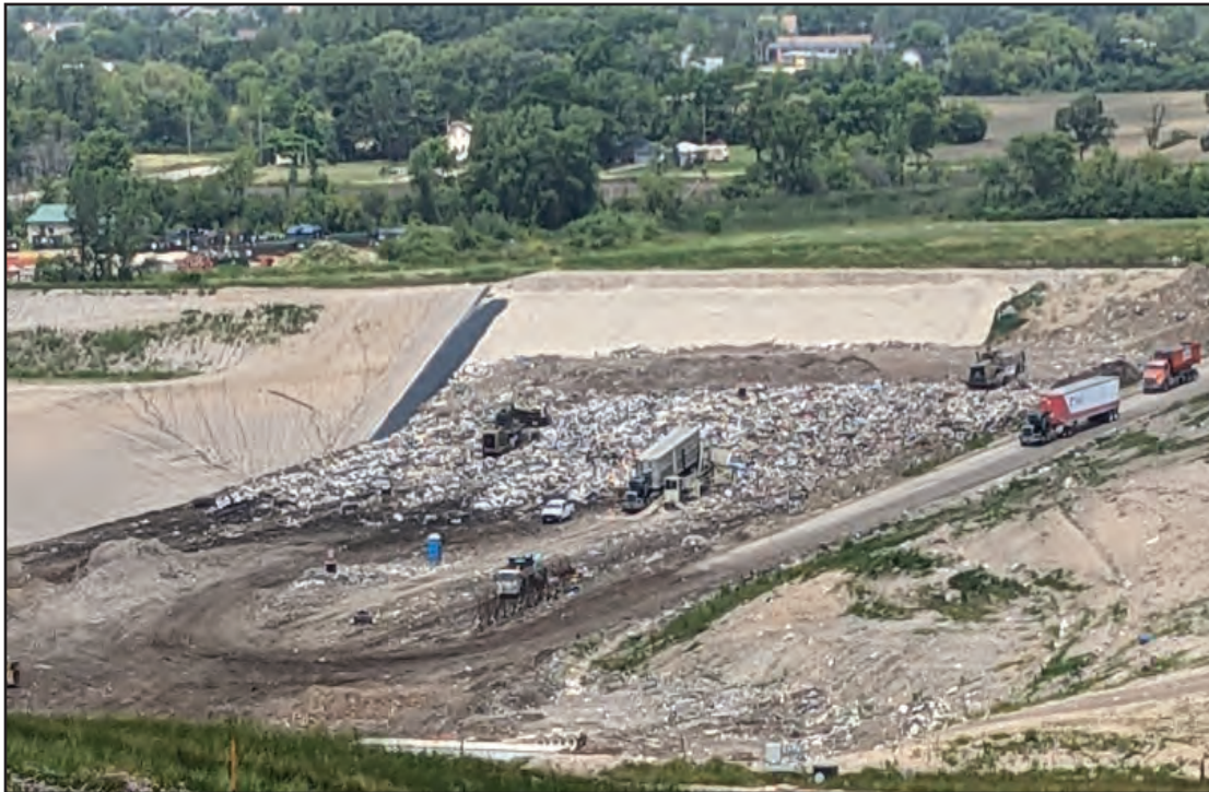
Working face in near middle of Phase 3, moving Southward