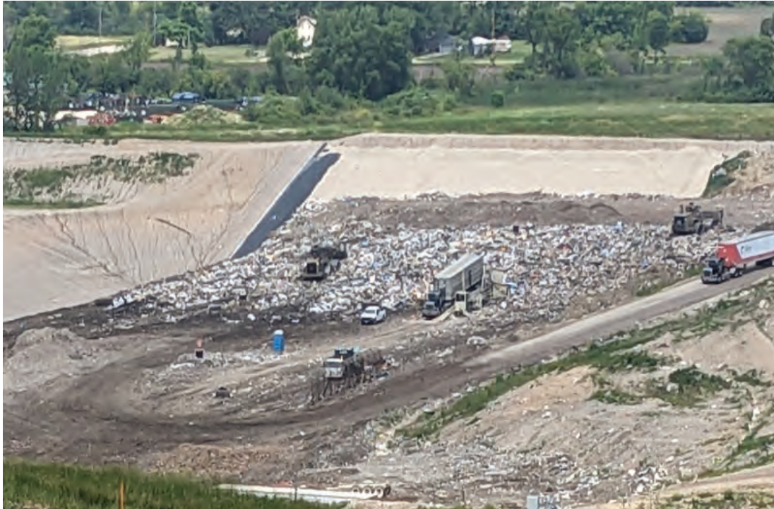
Working face width of whole cell and 1/4 of the length. No cover stockpiles