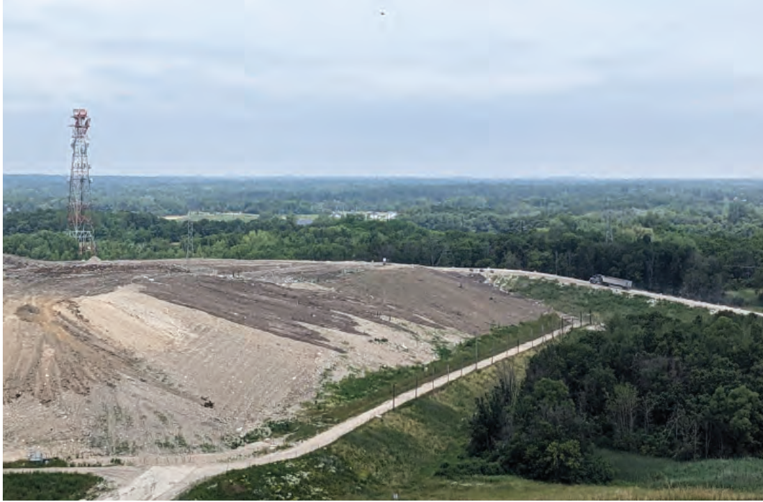
Phase 1 with fresh intermediate cover