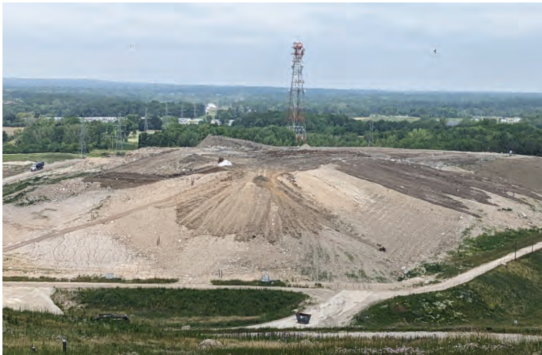
Phase 1 & 2 receiving additional intermediate cover