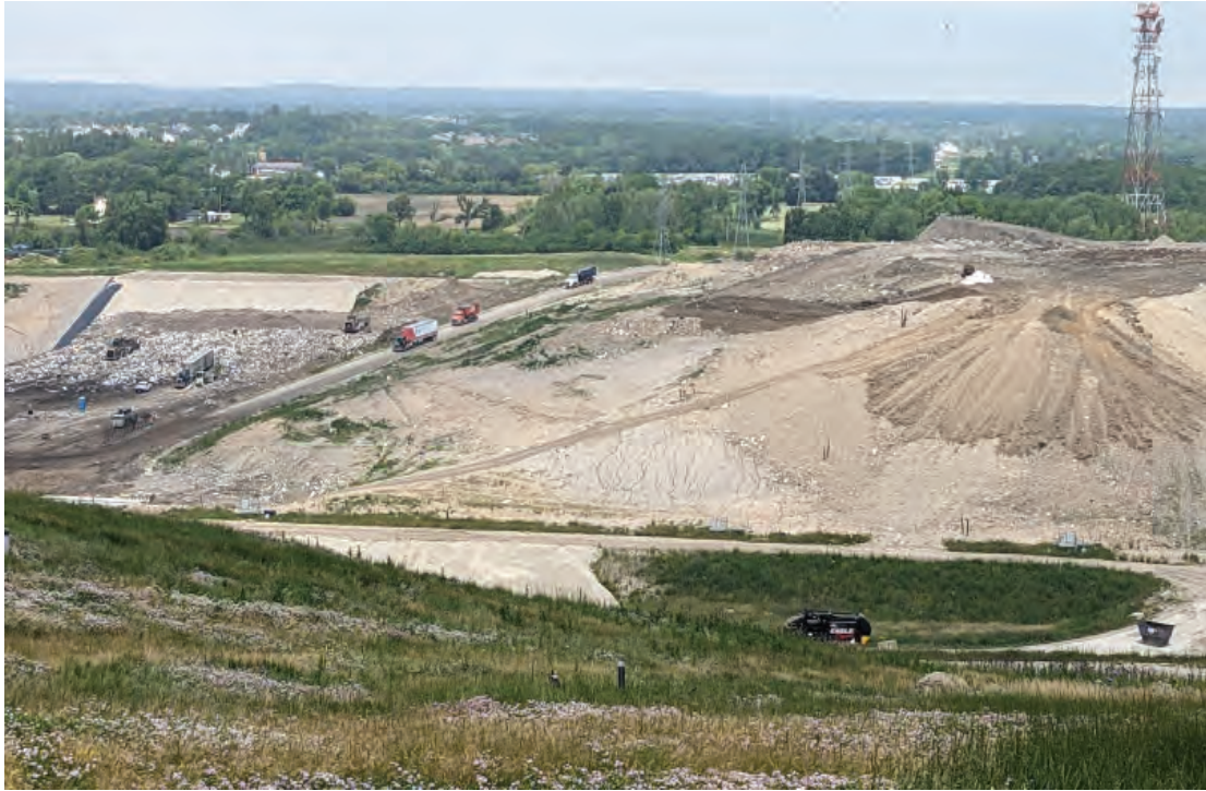
Transition from Phase 1 thru 3