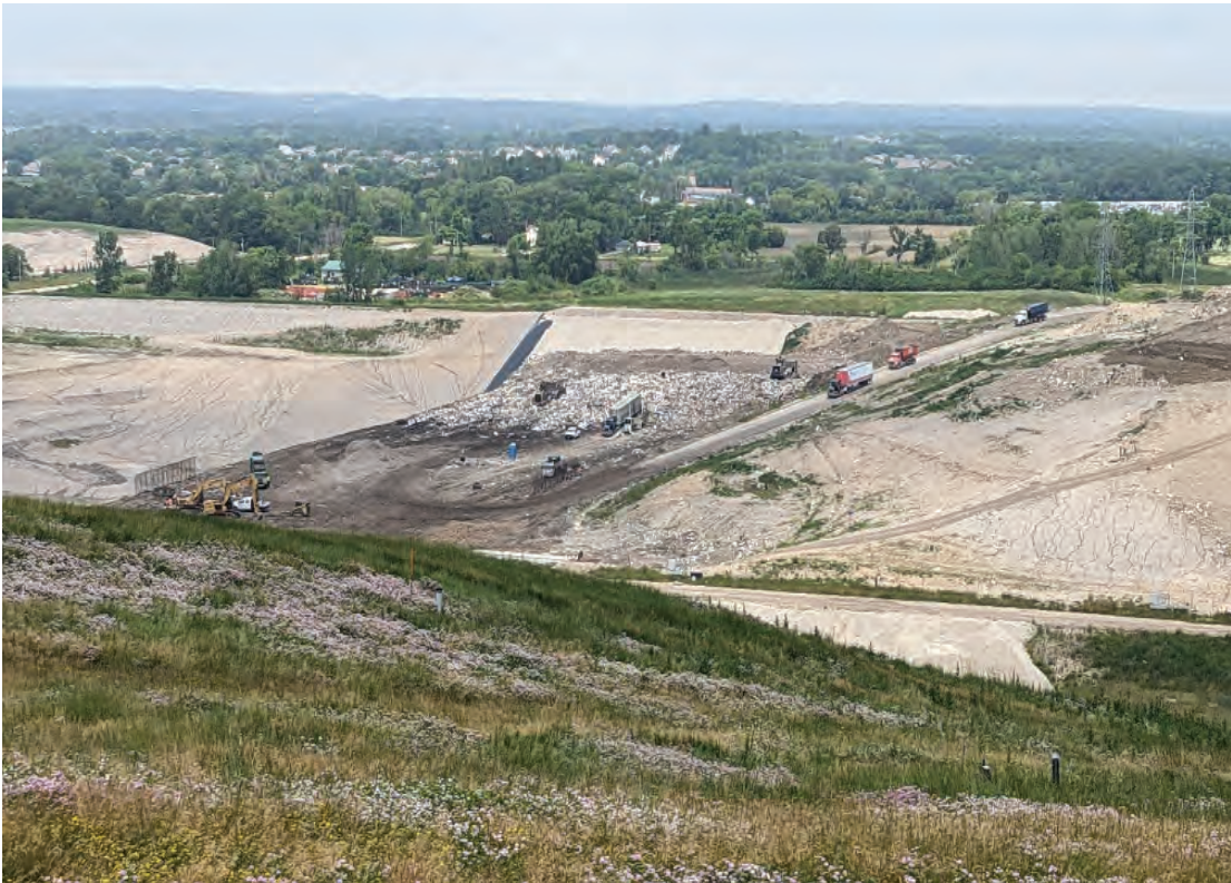
Overview of active area